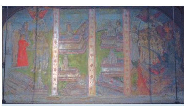
Doom painting at the east end of the nave in St Mary's parish church, North Leigh, West Oxfordshire.

Christ himself, the other twelve by the twelve apostles of the Catholic Apostolic Church. I never saw these vestments but I heard them described and the last of the 'apostles' was then still alive, though very old. All this was rich food for the imagination and the eye of the mind. A further link with the church and its history, for me, which made it accessible in spite of its strange provenance, was provided by the fact that my godmother had grown up as a member of the Catholic Apostolic Church and when she visited me in London in those days we went over to the church and walked through it together and sat and prayed there.